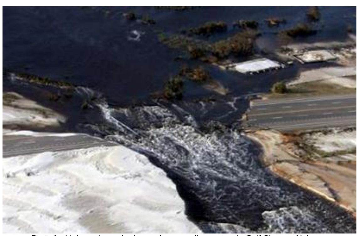
Part of a highway is washed away by receeding waters in Gulf Shores, Alabama