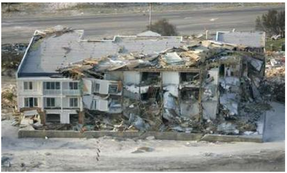
Severe damage to building is shown in Gulf Shores, Alabama