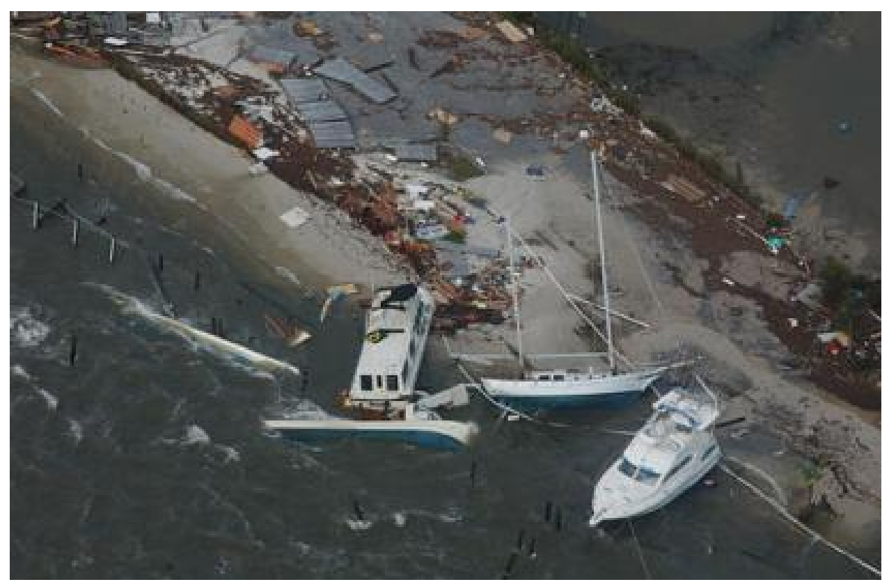
Boats are washed up on shore along the Gulf Coast near Milton, Fla