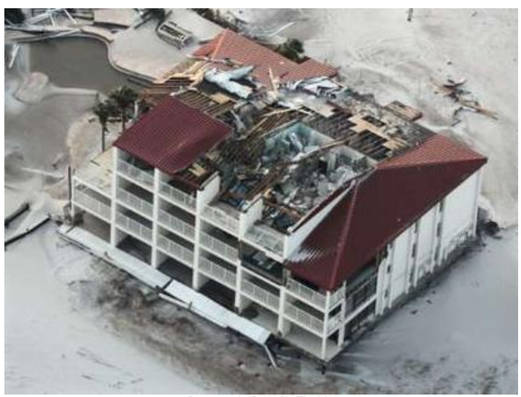
Pensacola Beach, Florida