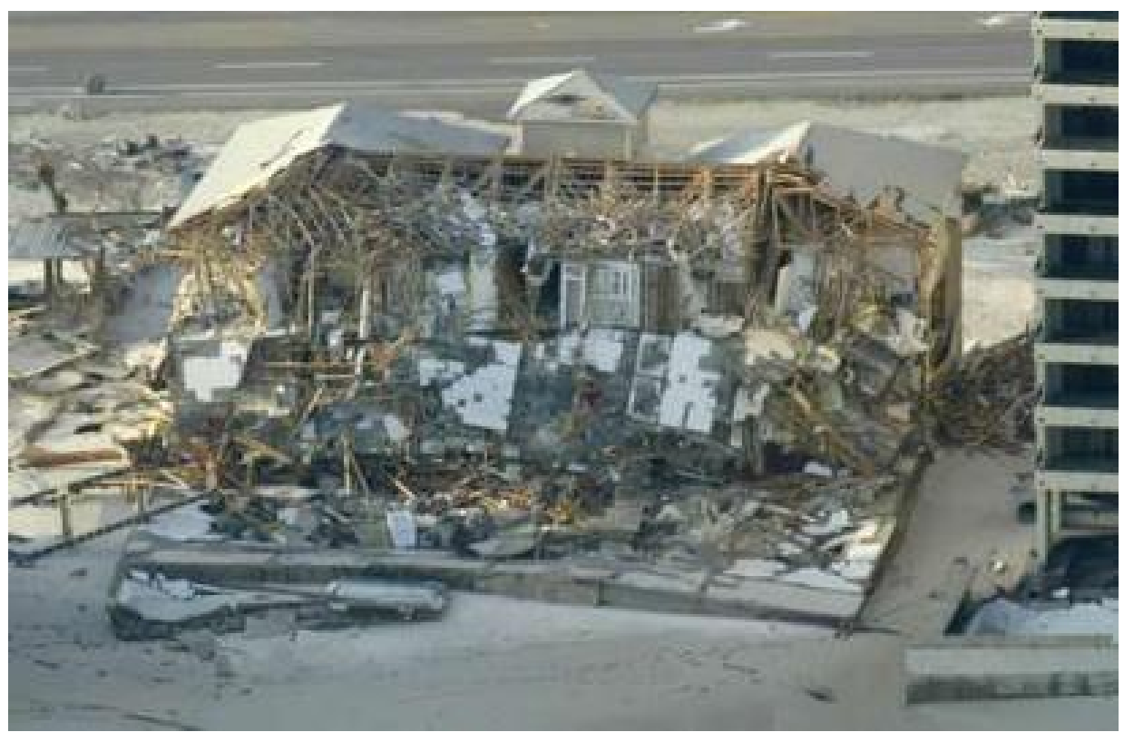
Pensacola Beach, Florida