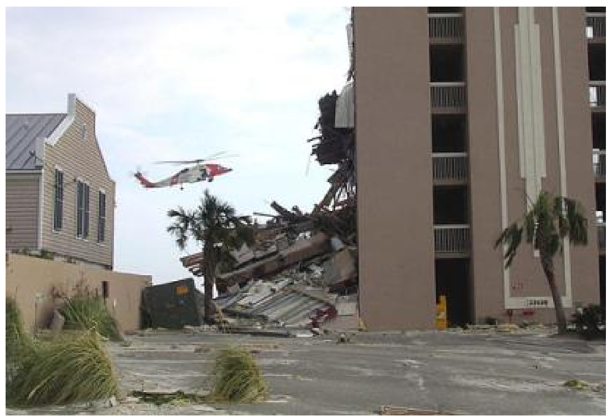
A U.S. Coast Guard helicopter flies past the remains of a condominium tower that partially collapsed in Orange Beach, Ala