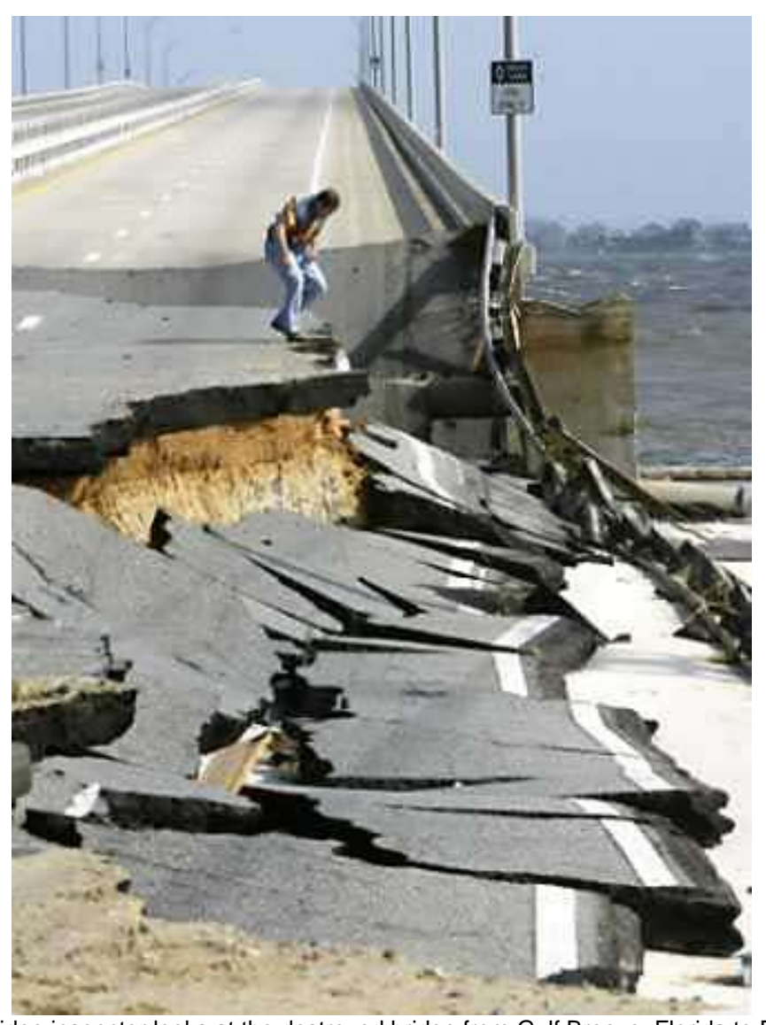
A Florida state bridge inspector looks at the destroyed bridge from Gulf Breeze, Florida to Pensacola Beach