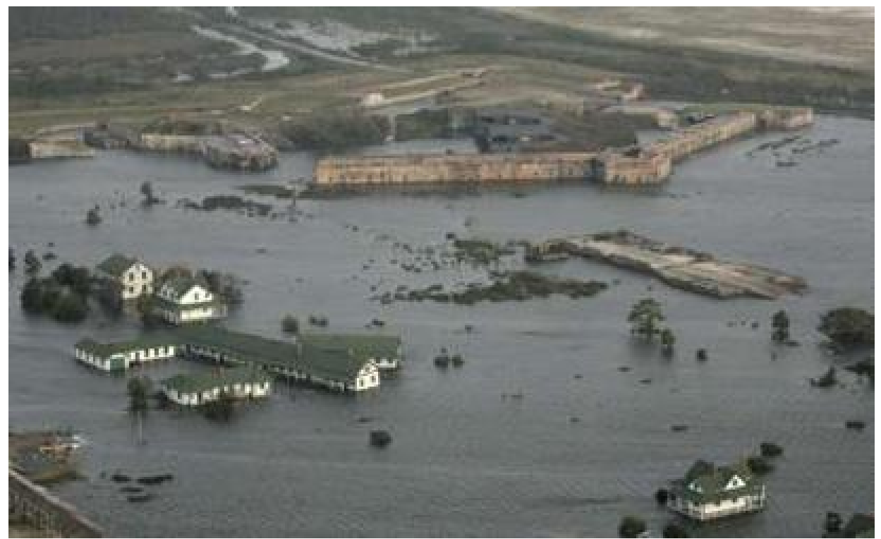
Historic Fort Pickens is shown in the Gulf Islands National Seashore is flooded in Pensacola Beach, Florida