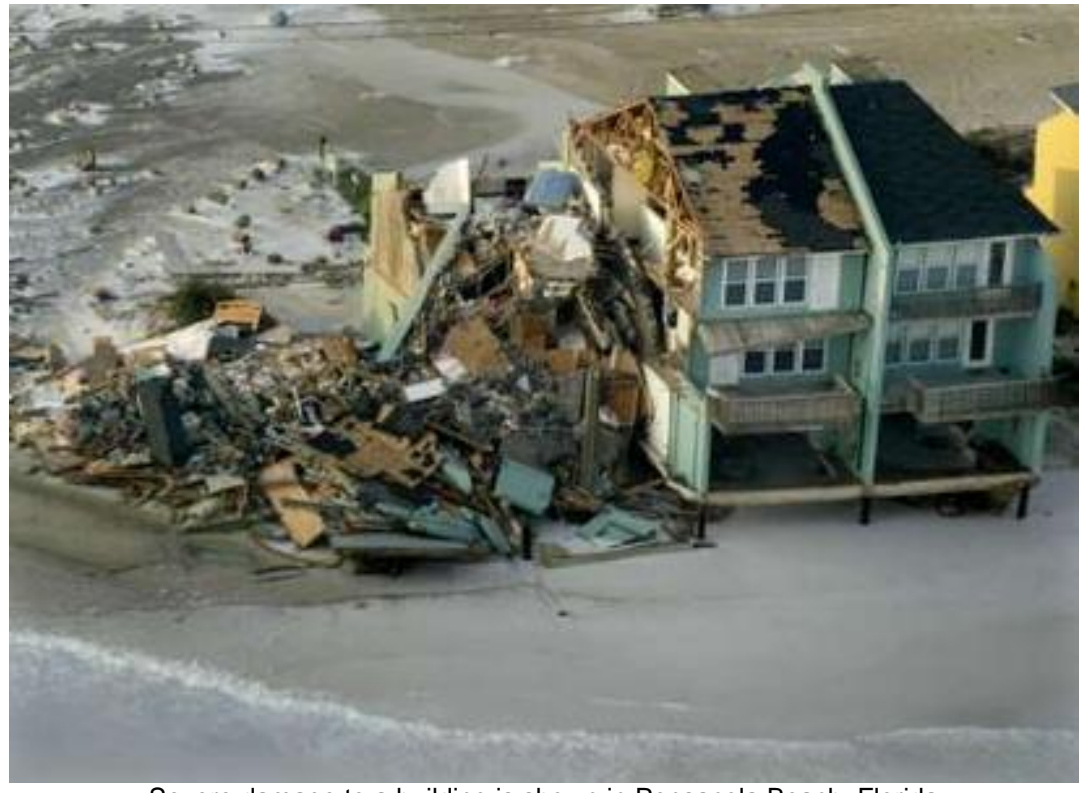
Severe damage to a building is shown in Pensacola Beach, Florida