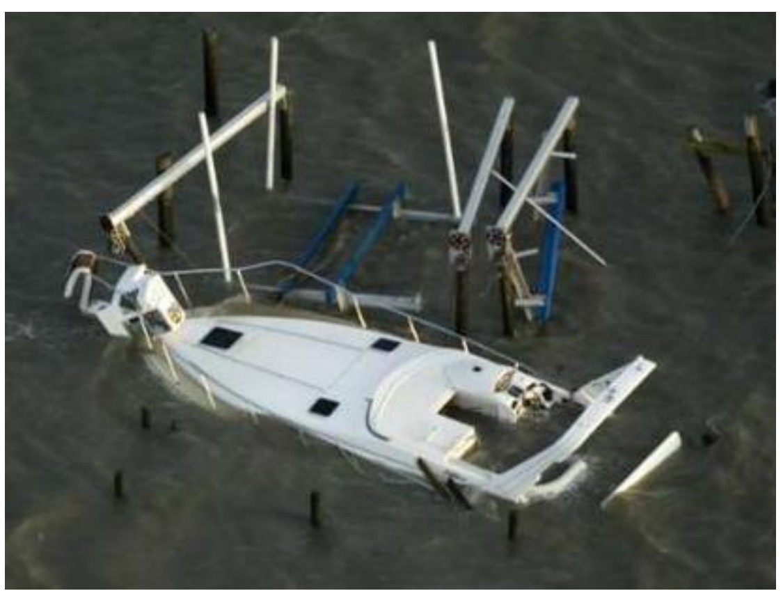
A large boat is shown in Pensacola Beach, Florida