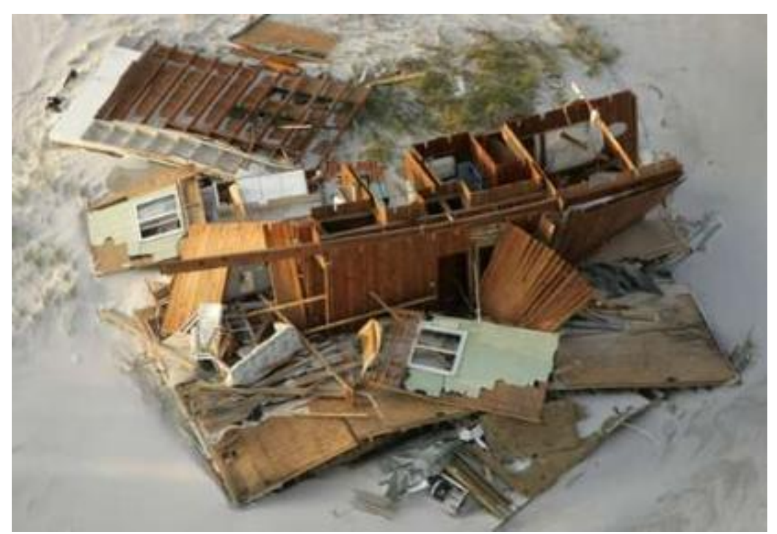
A destroyed beach house is shown in Gulf Shores, Alabama