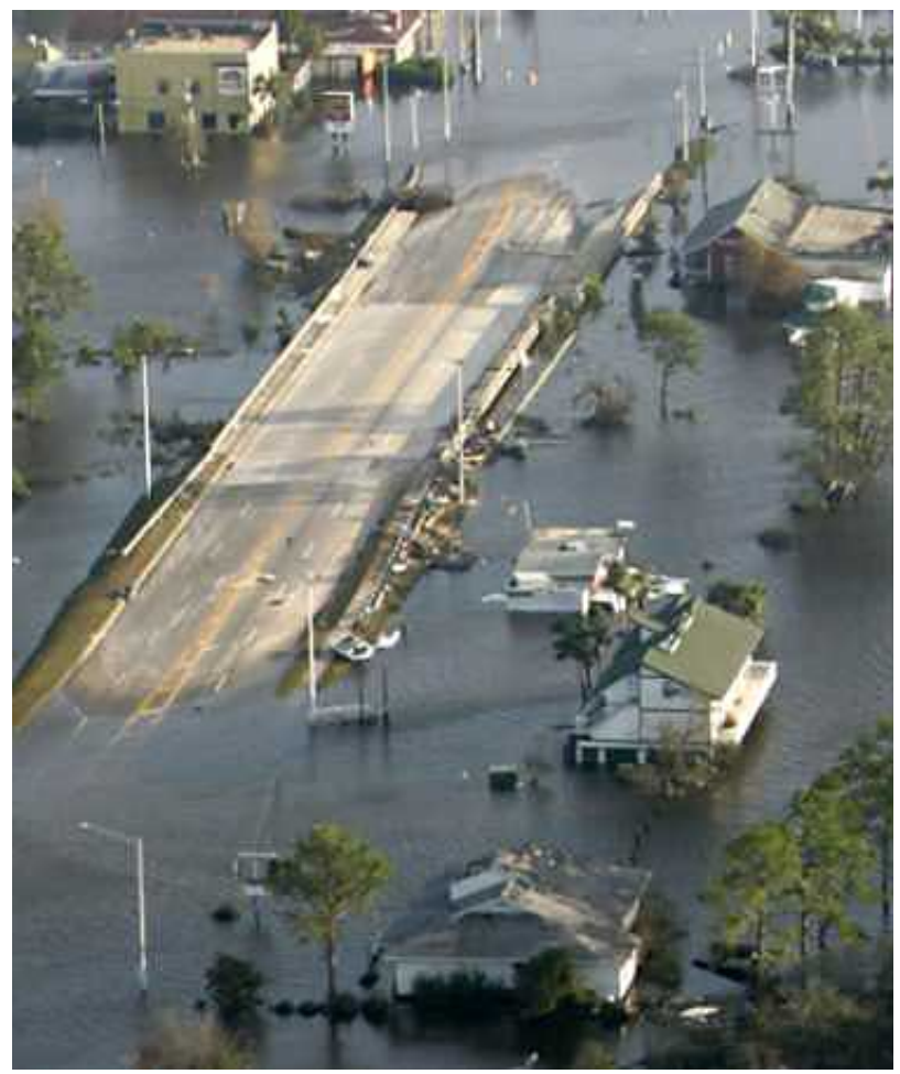
Only part of a highway through Gulf Shores, Alabama