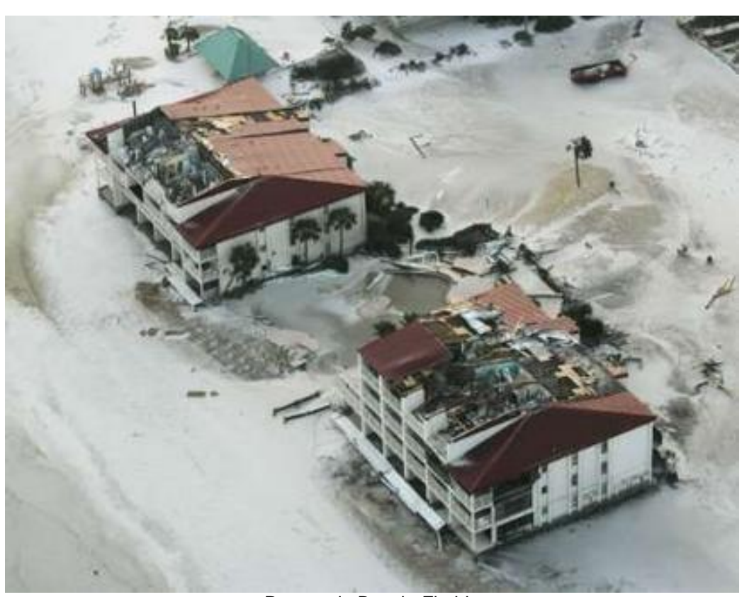
Pensacola Beach, Florida