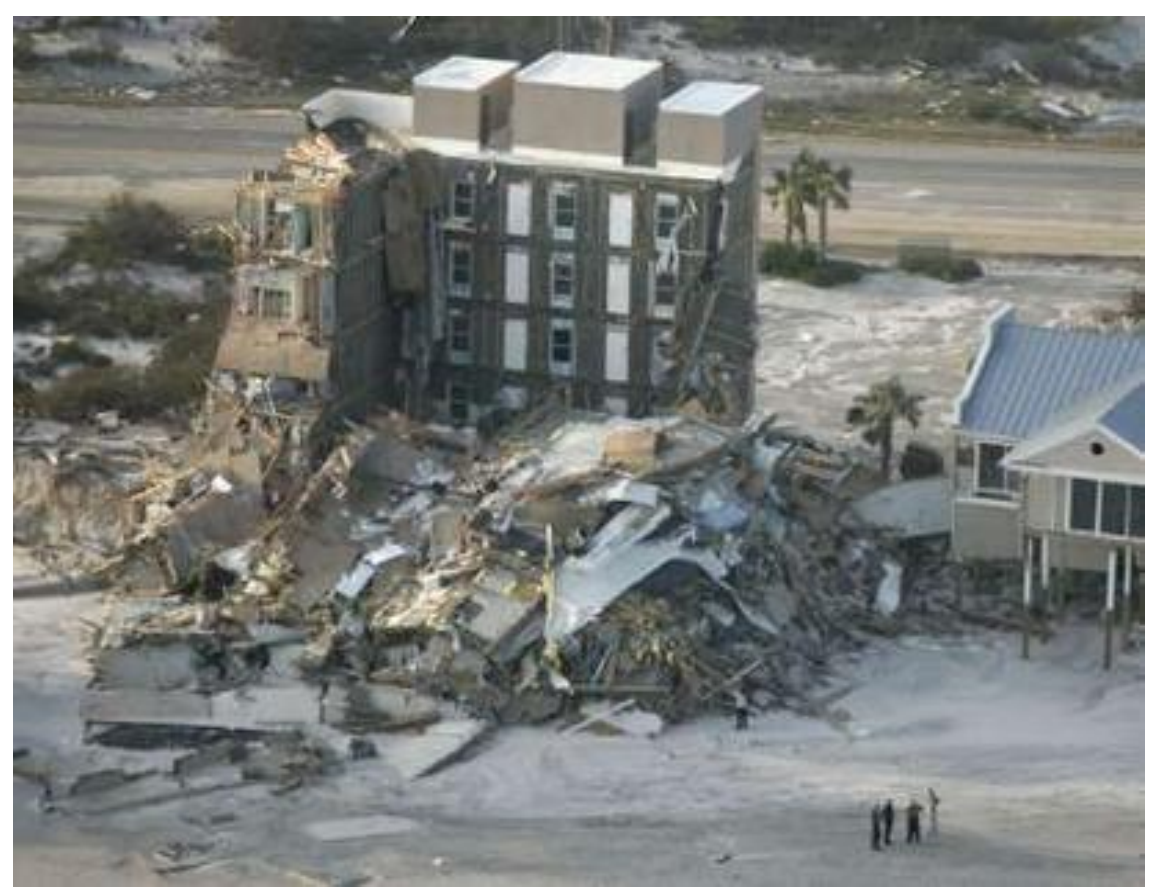
Pensacola Beach, Florida