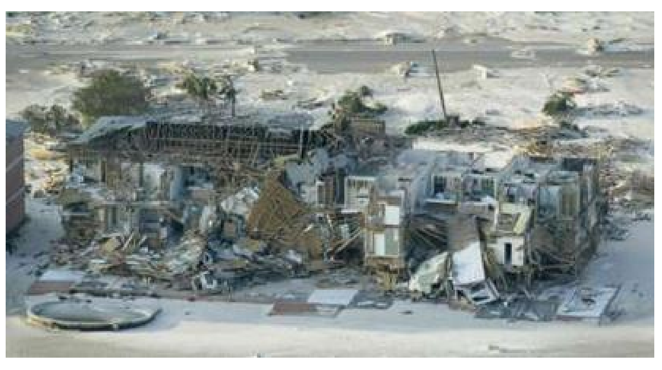
Pensacola Beach, Florida